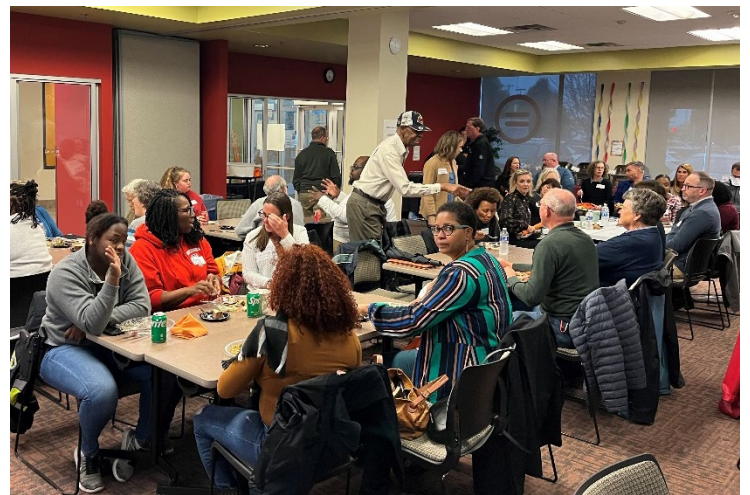
▼ 53 individuals representing 43 different organizations participated in the event