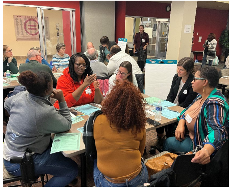
▲ A group discusses how the Alliant Energy Center can better establish connections with South Side institutions and investments