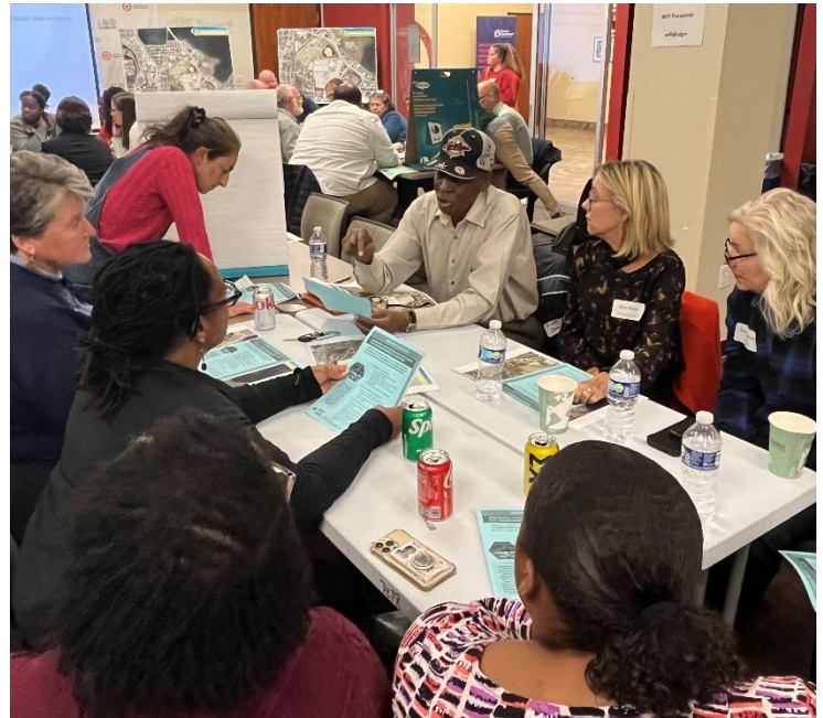
▲ A group discusses how the Alliant Energy Center can better meet the needs of South Side residents and underrecognized communities